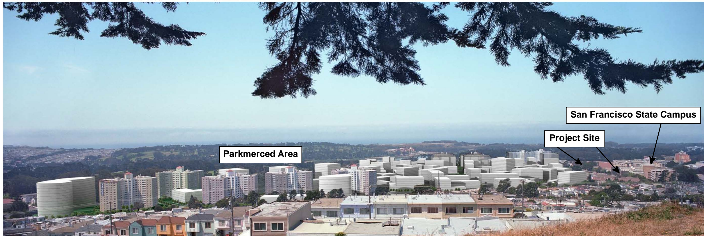
Future Conditions with Buildout of the Parkmerced Project